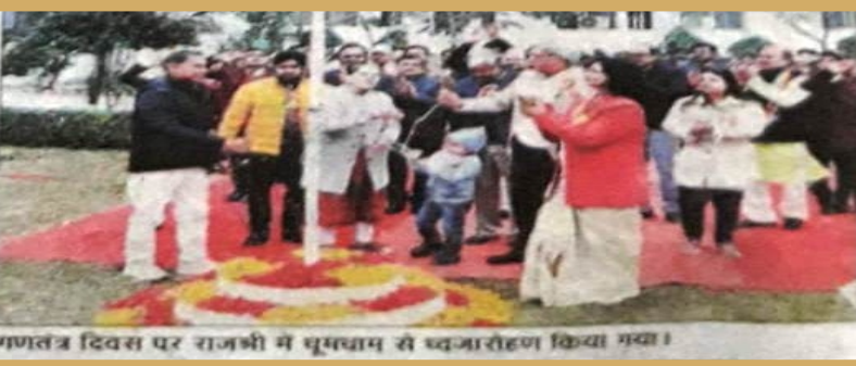
गणतंत्र दिवस पर राजश्री में प्रथम चरण से चक्रारोहण किया गया।